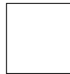
Photograph of Authorized representative attested by the candidate